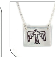
036 THUNDERBIRD $19 EACH; MIN: 1