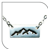
215 MNT BAR $19 EACH; MIN: 1