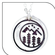
008 CRESCENT NIGHT $24 EACH; MIN: 1