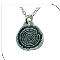
312 LOG $24 EACH; MIN: 1