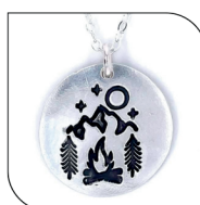
004 CAMP FIRE $24 EACH; MIN: 1