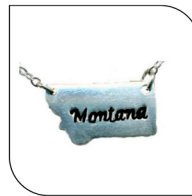
129 MT MINI MONTANA $19 EACH; MIN: 1