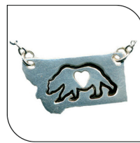
113 MT BEAR $24 EACH; MIN: 1