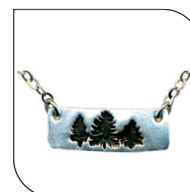
210 TREE BAR $24 EACH; MIN: 1