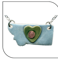
103 MT BRASS HEART $26 EACH; MIN: 2