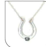
034 HORSESHOE $19 EACH; MIN: 1