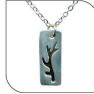
216 ANTLER SHED $19 EACH; MIN: 1