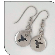
031 HUMMINGBIRD $19 EACH; MIN: 1