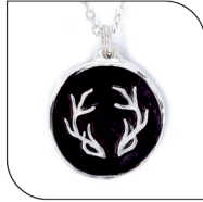
024 ANTLEERS $24 EACH; MIN: 1