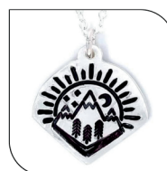
006 DAY & NIGHT $24 EACH; MIN: 1