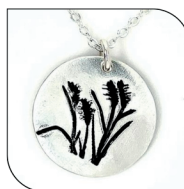
016 CATTAILS $24 EACH; MIN: 1