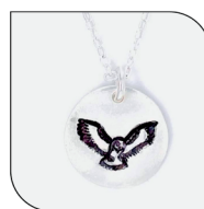
021 OWL OVAL $19 EACH; MIN: 1