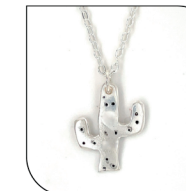
035 CACTUS $19 EACH; MIN: 1