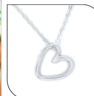
037 HEART $19 EACH; MIN: 1