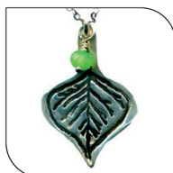
310 ASPEN LEAF $26 EACH; MIN: 1

Reflection of Nature | 2023 All Sterling Silver | 18" Silver Chain and Clasp