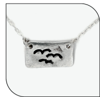
022 FLYING BIRDS $19 EACH; MIN: 1