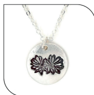
015 WILDFLOWER $19 EACH; MIN: 1