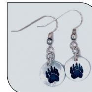
030 BEAR PAW $19 EACH; MIN: 1