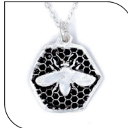
026 HONEYBEE $24 EACH; MIN: 1