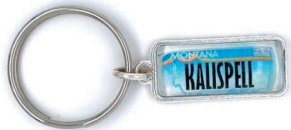
115 LICENSE PLATE BLUE $8 EACH; MIN: 2

Size 1/2" x 1" | Charms can be personalized and Please specify lobster claw or keychain