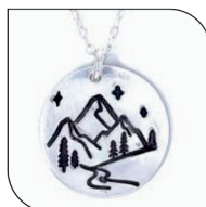
007 RIVER $24 EACH; MIN: 1