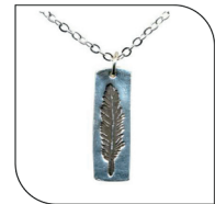
213 FEATHER RECT $19 EACH; MIN: 1