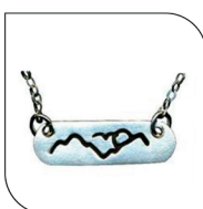
317 SMALL MTN $19 EACH; MIN: 1