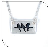
023 PERCHED BIRDS $19 EACH; MIN: 1