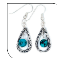
038 DROPLET $24 EACH; MIN: 1