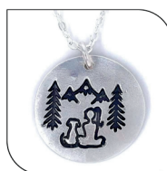
005 BEST FRIEND $24 EACH; MIN: 1