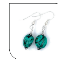
039 BEADS $19 EACH; MIN: 1