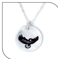
020 EAGLE OVAL $19 EACH; MIN: 1