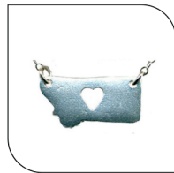
127 MT MINI HEART $19 EACH; MIN: 1

All Silver | Size: 3/4 inch x 1/4 inch | All Silver with 18" Chain and Clasp