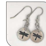
032 DRAGONFLY $19 EACH; MIN: 1