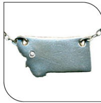
110 MT CRYSTAL CITY $26 EACH; MIN: 2