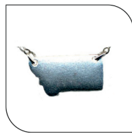
128 MT MINI PLAIN $19 EACH; MIN: 1