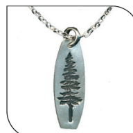
319 SINGLE TREE $24 EACH; MIN: 1