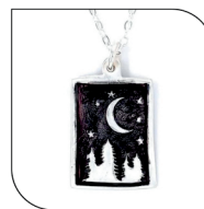
009 DARK NIGHT $24 EACH; MIN: 1