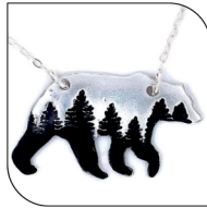
017 TIMBER BEAR $26 EACH; MIN: 1

All Sterling Silver | 18" Silver Chain and Clasp