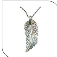
324 SILVER FEATHER $26 EACH; MIN: 1