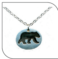
217 BEAR OVAL $19 EACH; MIN: 1