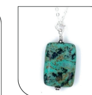
040 PENDANT $24 EACH; MIN: 1