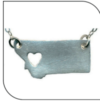
101 MT HEART CITY $24 EACH; MIN: 1