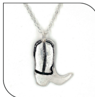
033 BOOT $19 EACH; MIN: 1

All Sterling Silver | 18" Silver Chain and Clasp