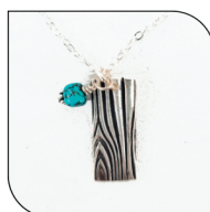
311 TREE TRUNK $24 EACH; MIN: 1