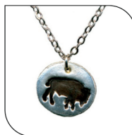
214 BUFFALO OVAL $19 EACH; MIN: 1