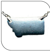
041 MONTANA $24 EACH; MIN: 1

All Silver | Size: 1 x 3/4 inch | All Silver with 18" Chain and Clasp