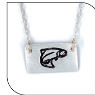
027 FISH $19 EACH; MIN: 1