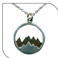
320 ROUND MTNS $24 EACH; MIN: 1

Mountains are Calling | 2023 All Sterling Silver | 18" Silver Chain and Clasp